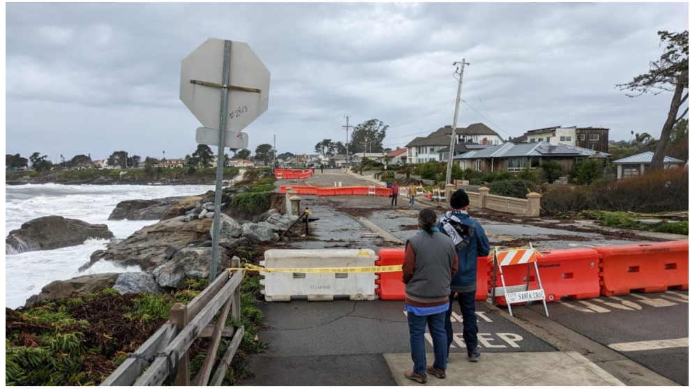
Storm damage prompts authorities to close West Cliff Drive near Woodrow Avenue in January 2023.