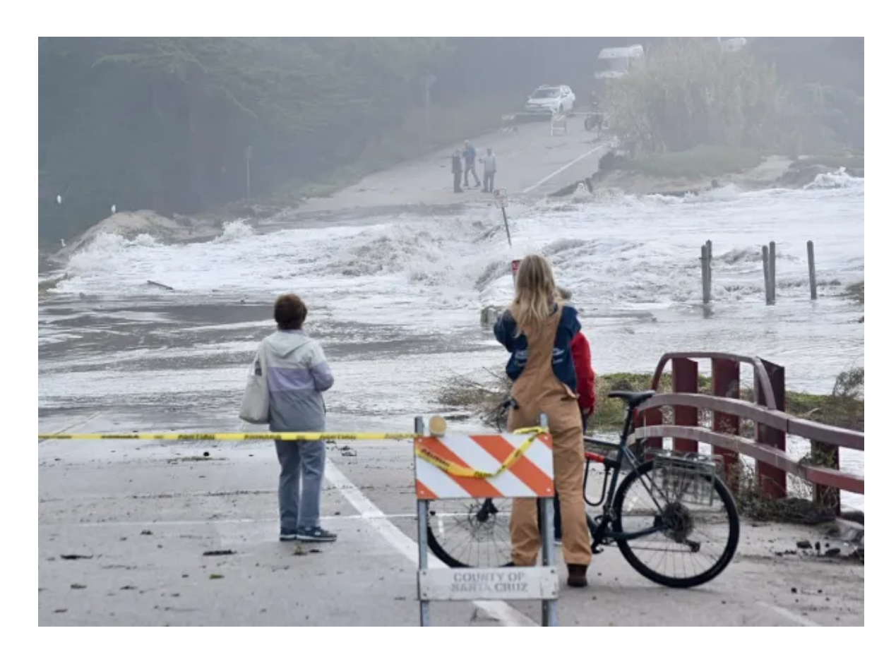
Corcoran Beach was swallowed whole Thursday morning as high tide and high swell combined to overtop East Cliff Drive.

SANTA CRUZ — Very high swell and surf conditions collided with high tide Thursday morning to unleash damaging waves along Santa Cruz County's coastline.