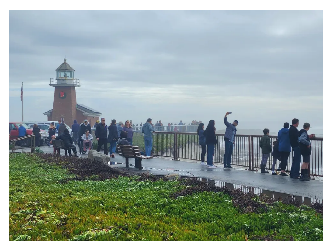
A spectator near Lighthouse Point takes a selfie as massive waves come crashing into the coast Thursday.