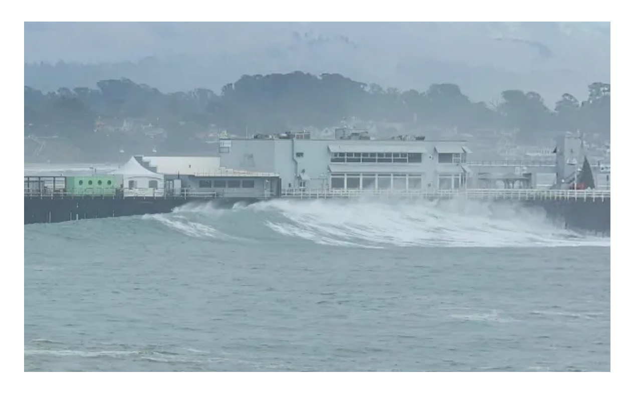
The Santa Cruz Wharf was evacuated and closed Thursday due to high surf, which barraged the structure with massive waves.

In the morning, the city of Santa Cruz closed Main and Cowell beaches, with the Santa Cruz Fire Department Marine Safety Division rescuing some individuals living on Cowell Beach who were nearly trapped by the rising tide. Later, the Santa Cruz Municipal Wharf was evacuated and its businesses closed for the day after at least 20-foot waves reached up beneath the structure and tore out wharf pilings, two sprinklers and appeared to damage a water main and sewer pipe, according to Marine Safety Capt. Brian Thomas.